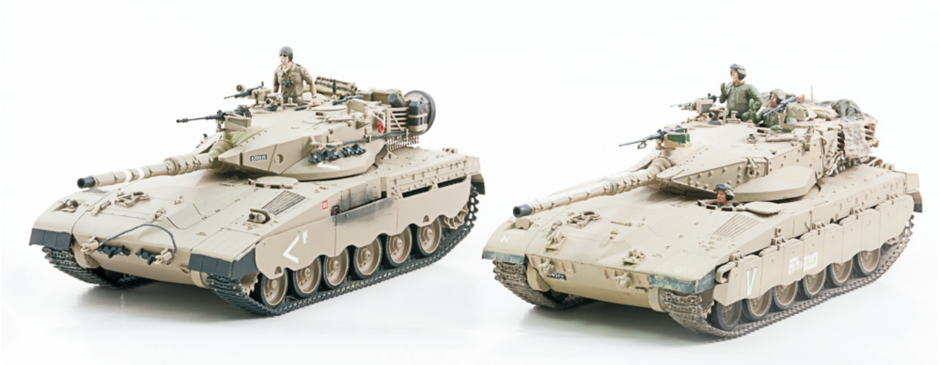
Carl Webster's Merkava's of the IDF all in 1/35th scale.