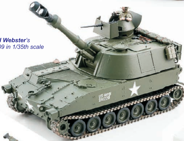
Carl Webster's M109 in 1/35th scale