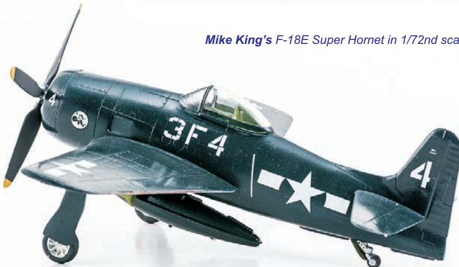
Mike King's 1/72nd scale F8F-1 Bearcat

Carl Webster had a number of Merkava's of the IDF to show. All were in 1/35th scale. Carl had a Mk 1 built from the Tamiya kit, a Mk 2 built from the Academy kit, a Mk 3 built from the Academy kit, A Mark 3D built from the Academy kit and the AEF Design Conversion. Other models shown by Carl were a M109 built from the Italeri