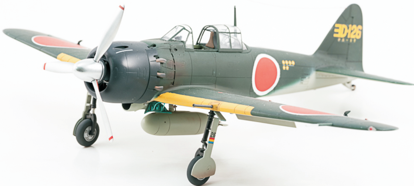
Mike Boudreaux's A6M5 type 52 in 1/48th scale