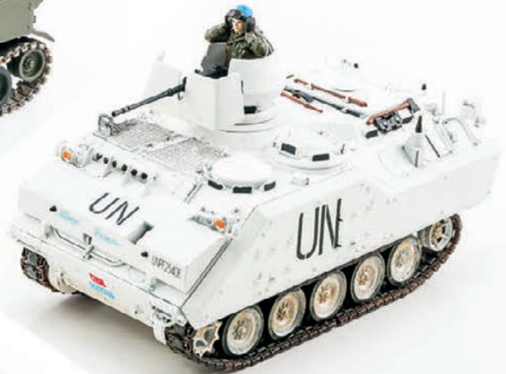
Carl Webster's 1/35th scale UN personnel carrier