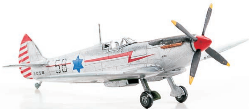
Charlie Flores' 1/144th scale Spritfire Mk.IX