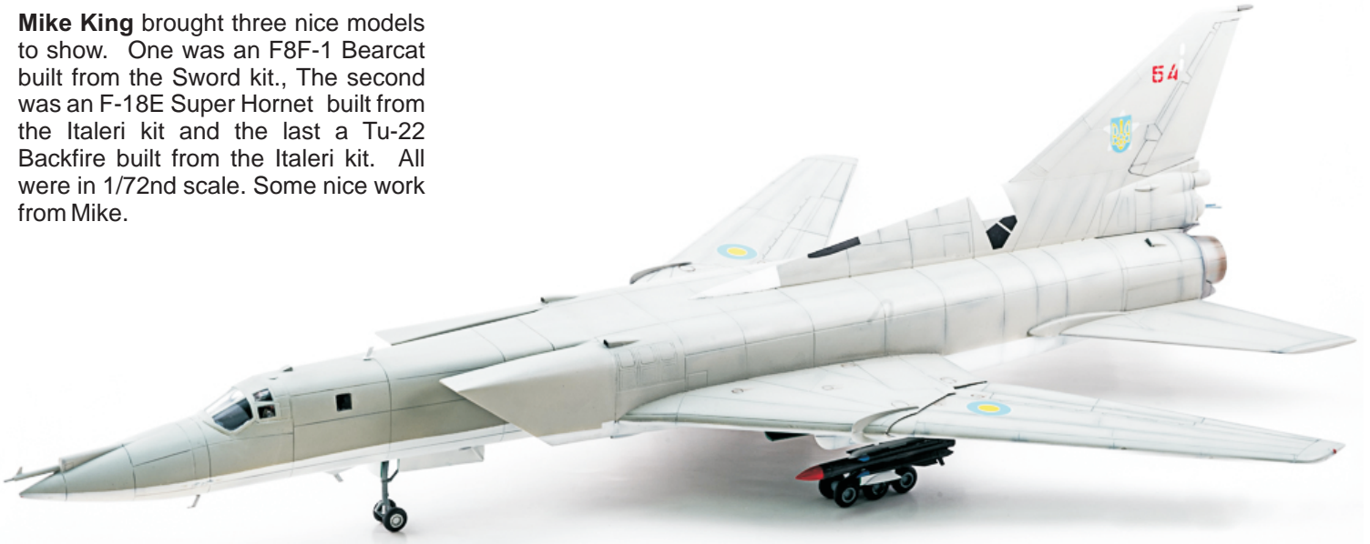
Mike King's 1/72nd Tu-22 Backfire

Mike King brought three nice models to show. One was an F8F-1 Bearcat built from the Sword kit., The second was an F-18E Super Hornet built from the Italeri kit and the last a Tu-22 Backfire built from the Italeri kit. All were in 1/72nd scale. Some nice work from Mike.