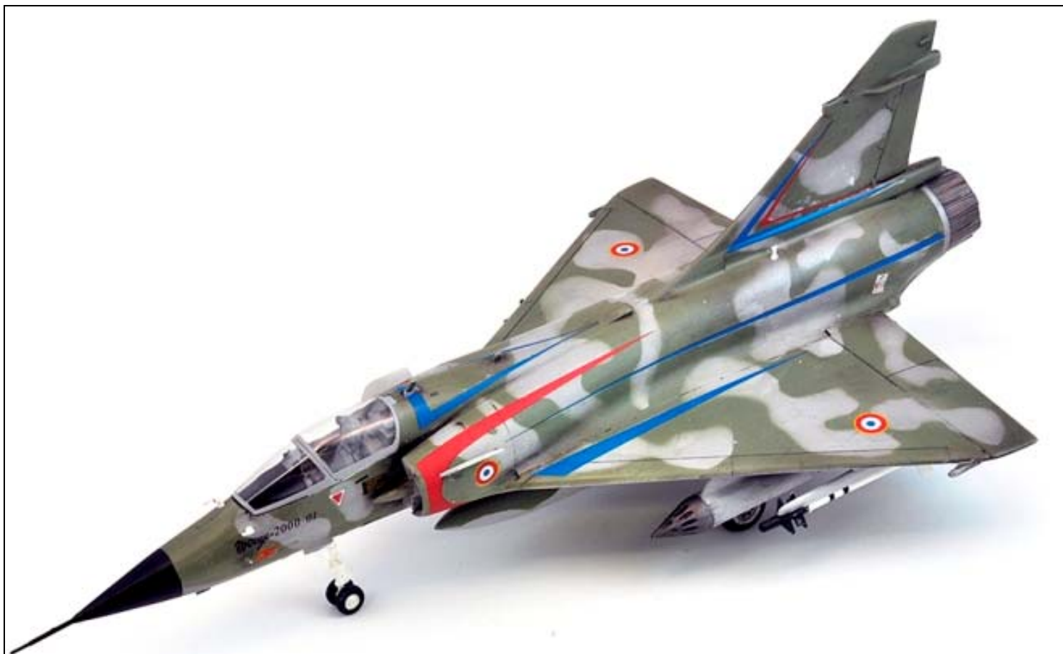
Carlos Delgado's Mirage 2000