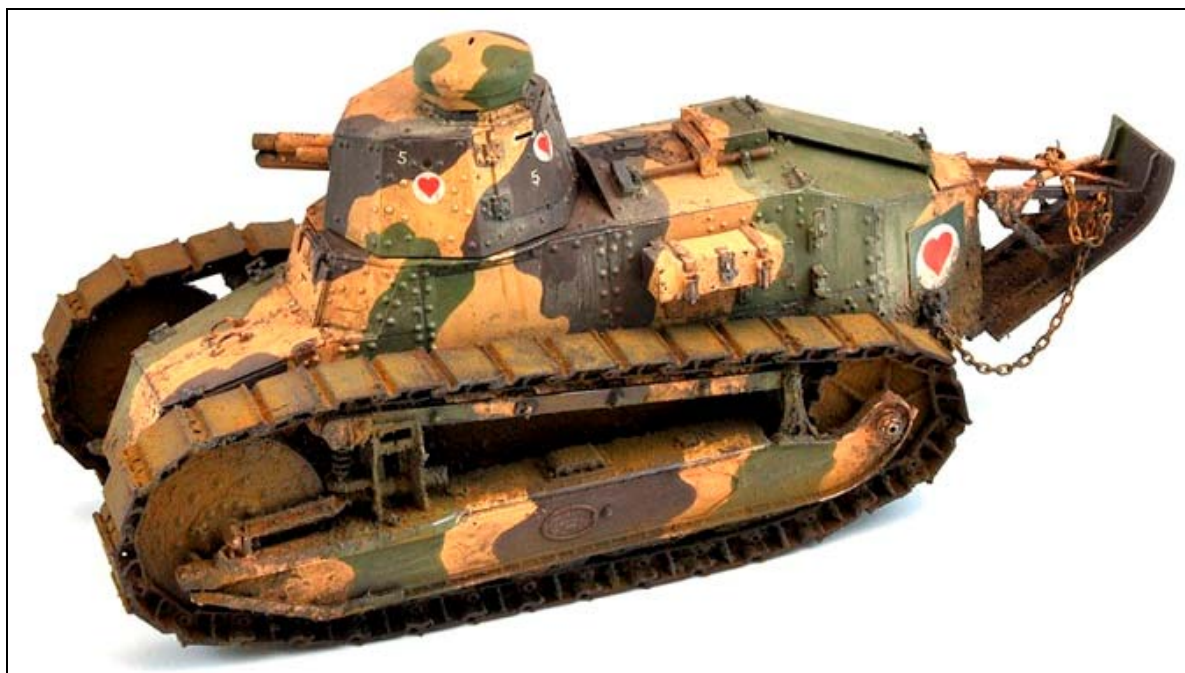
David Torres Ming Ft-17

We started with only about nineteen members at our September meeting but ended with a bang, with 30 that had arrived at various times during the afternoon.