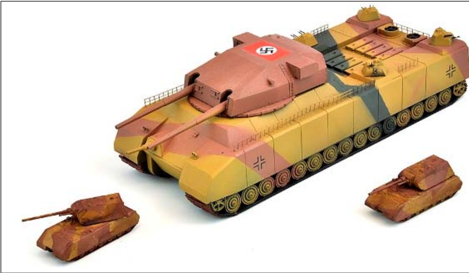
Sal Saminego's armor comparisons.