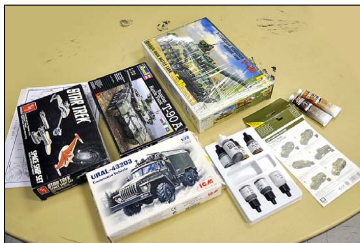
Joe Roper's armor and Vallejo OD paint set

The Bassett Place show is still waiting on our getting our insurance from the IPMS National Office. I cannot meet the requirements set up by the Bassett folks in Dallas until I have all the info