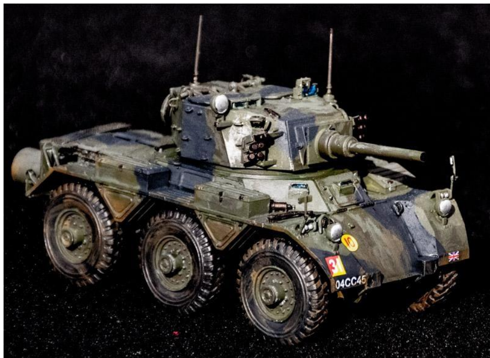
Art Berdick's Saladin Mk .2