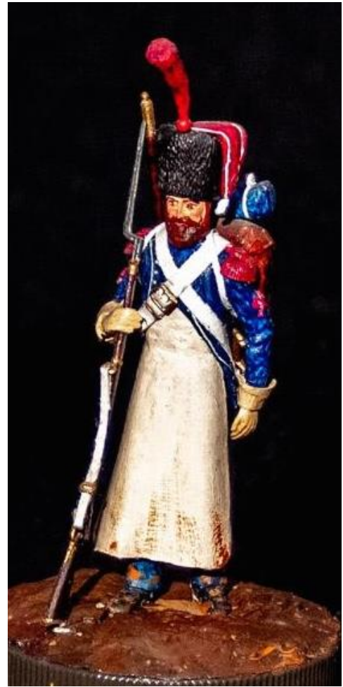
Another Sapper by Art Berdick