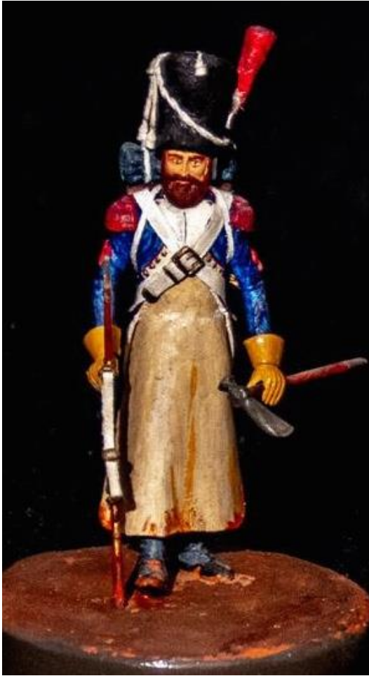
Art Berdick's Sapper