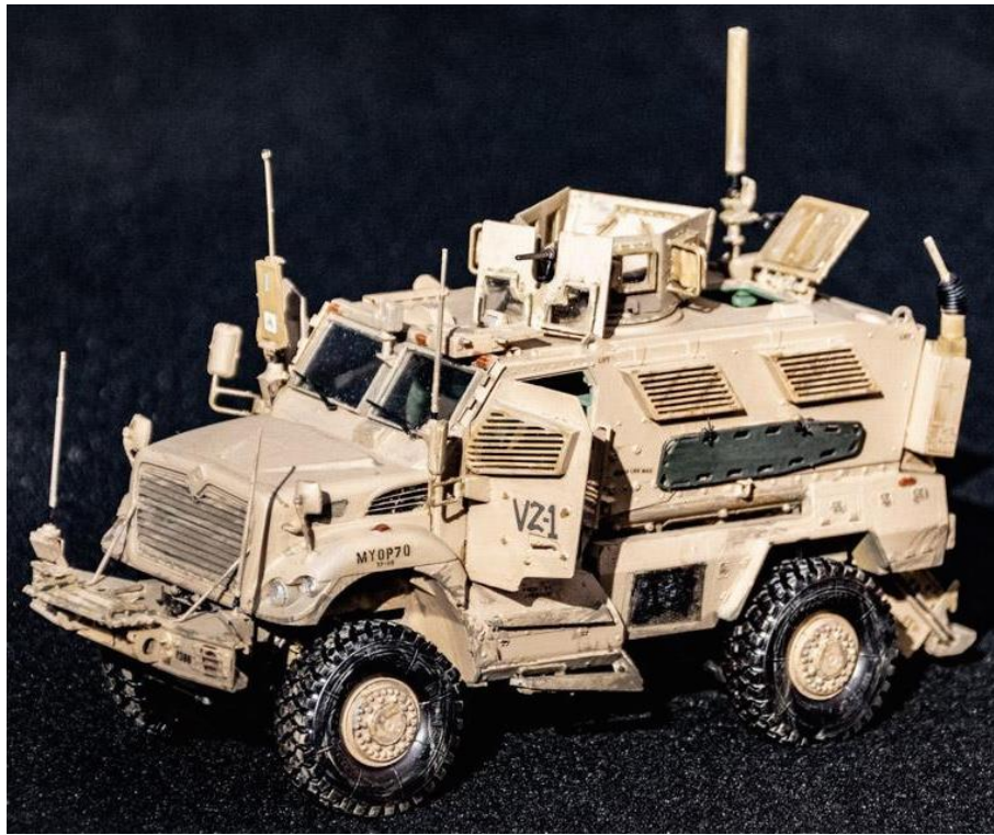
Art Berdick's M1235A1

Some additional information on the models from the photo info sheets.