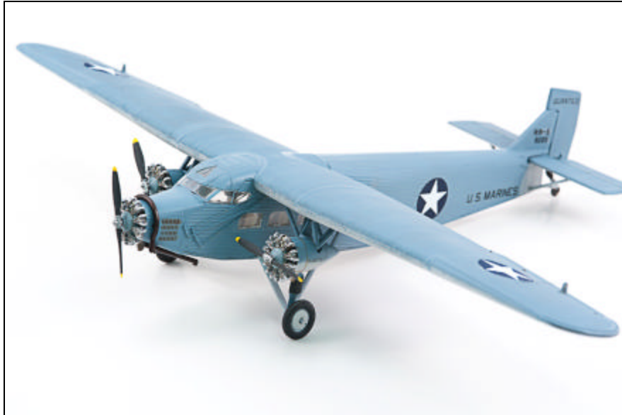
Mike King's Ford Tri-Motor in 1/72 nd scale.