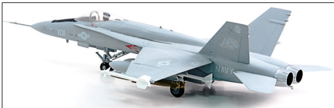
Steve's F-18 in 1/48 th scale.