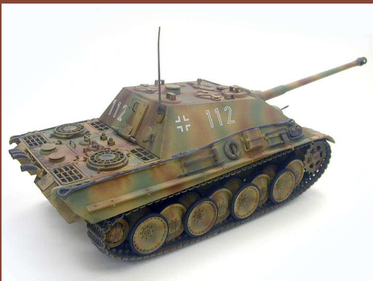
1/24th scale Jagdpanther by Fred Gonzales