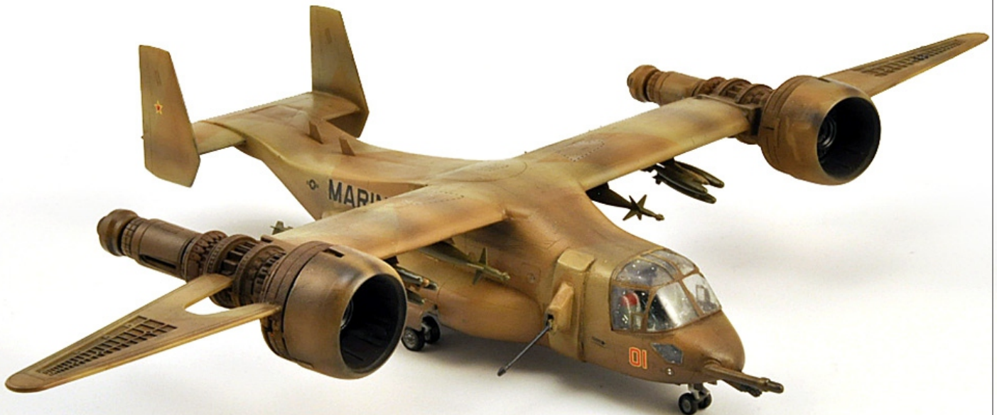
Eduard Rogers' MV-22X What-If Osprey in 1/72nd