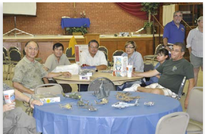
Guests, friends and family