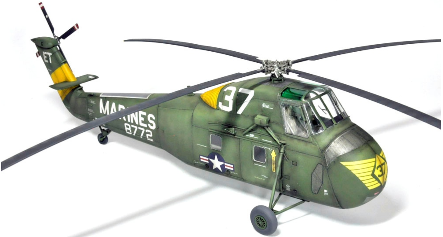
Fabian Nevarez's UH-34D in 1/48th scale

Our 45th annual Bassett Place Mall show was held on Sunday, August 11. Set up time is 8:00A.M. The tables should be ready for model placement by 8:30 or so. Fourteen people signed the sheet to participate. One or two more will probably show up to display.