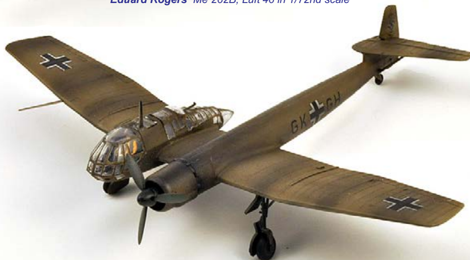
Eduard Rogers' Blohm and Voss BV-141 in 1/72nd scale