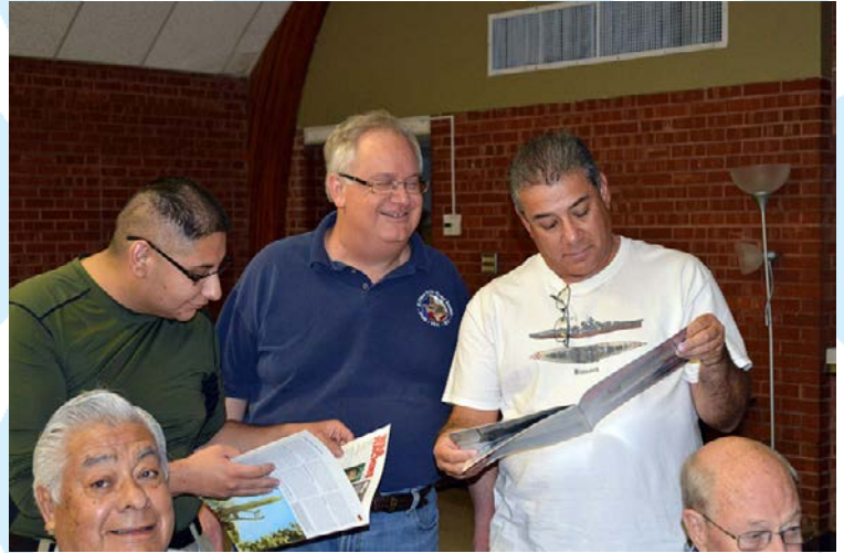
All Smiles in this Corner...