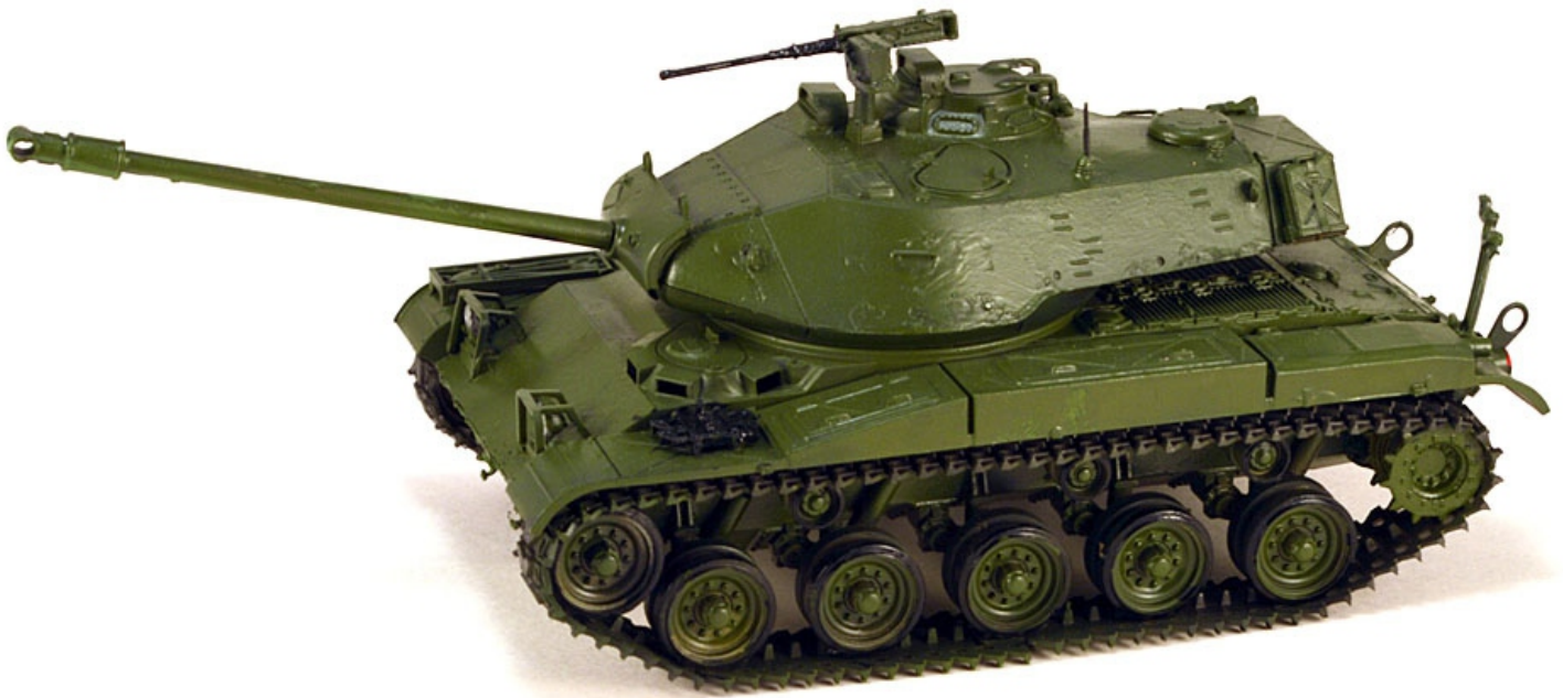
Sal Samaniego's M41 "Bulldog" in 135th scale