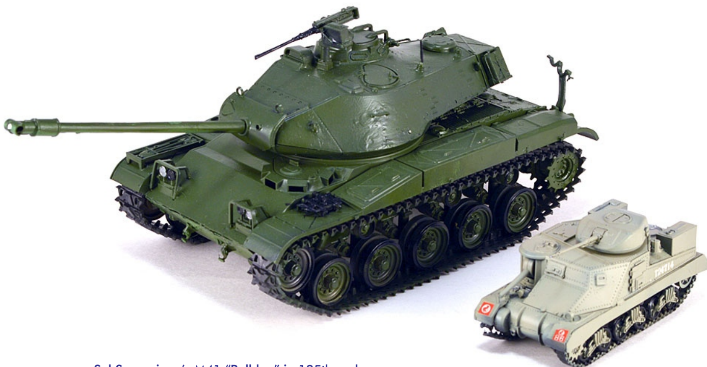
Sal Samaniego's M41 "Bulldog" in 135th scale and M3 Grant in 1/72nd scale