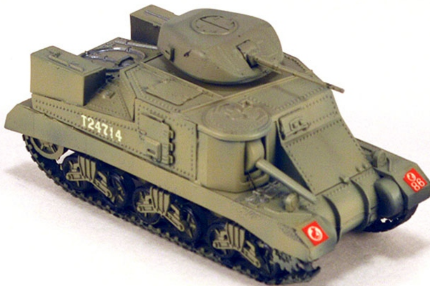
Sal Samaniego's M3 Grant in 1/72nd scale