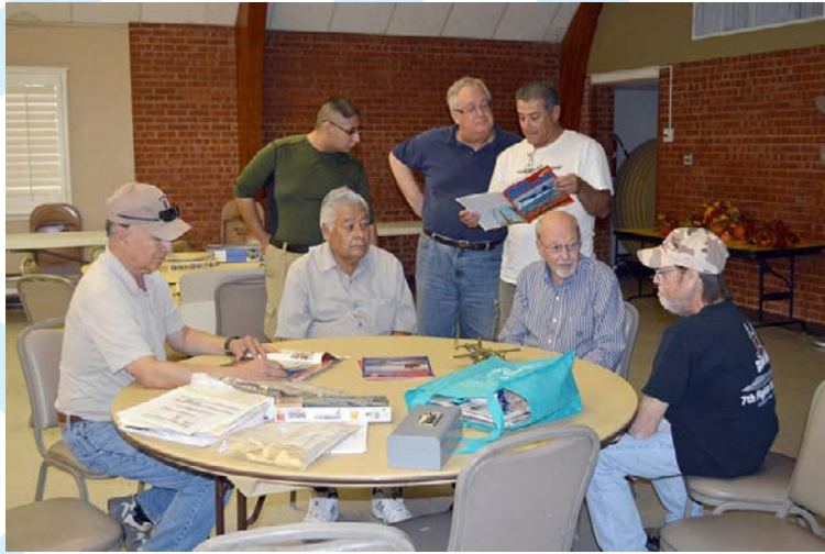
Busy Chat around the Magazines Table