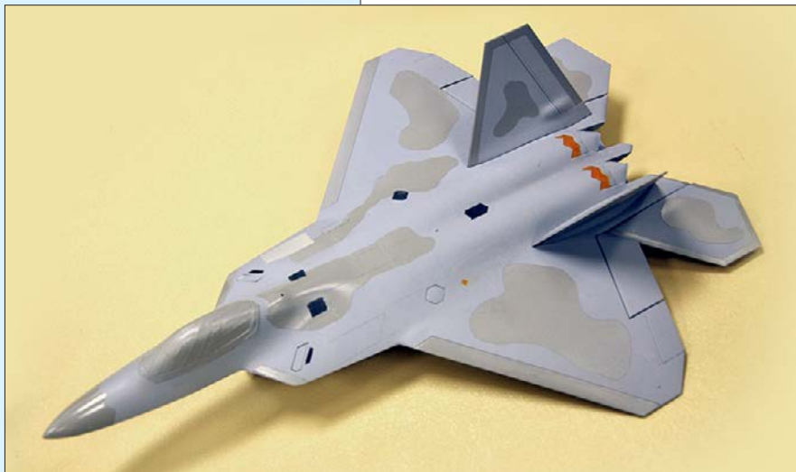
Richad Macias' 1/48th scale F-22 Raptor