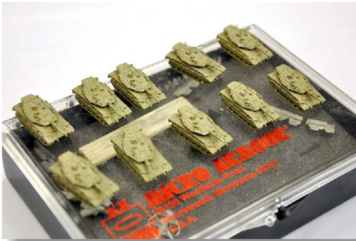
Kai Garcia's 1/285th scale M113 and Merkava III in IDF markings.