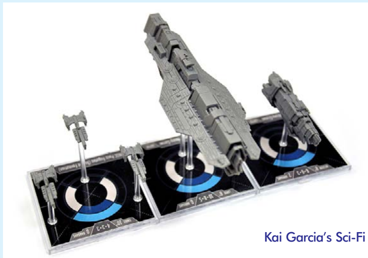
Kai Garcia's Sci-Fi items in 1/10000 scale