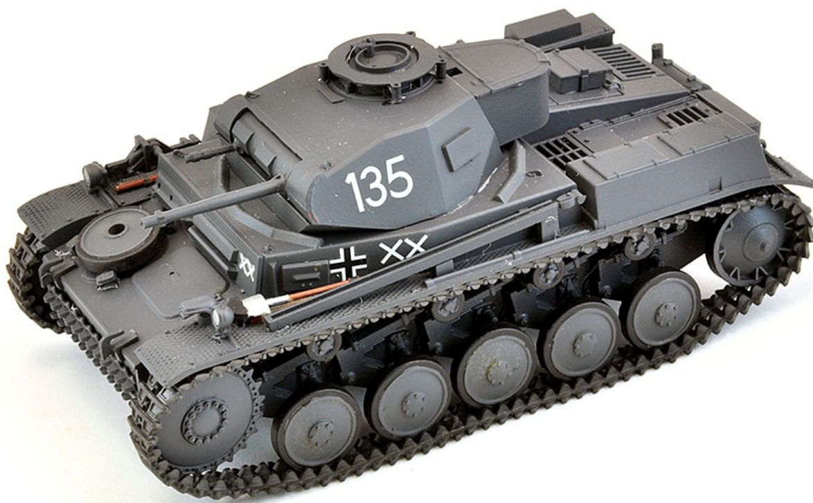
Roger Gutierrez Panzer II in 1/35th scale