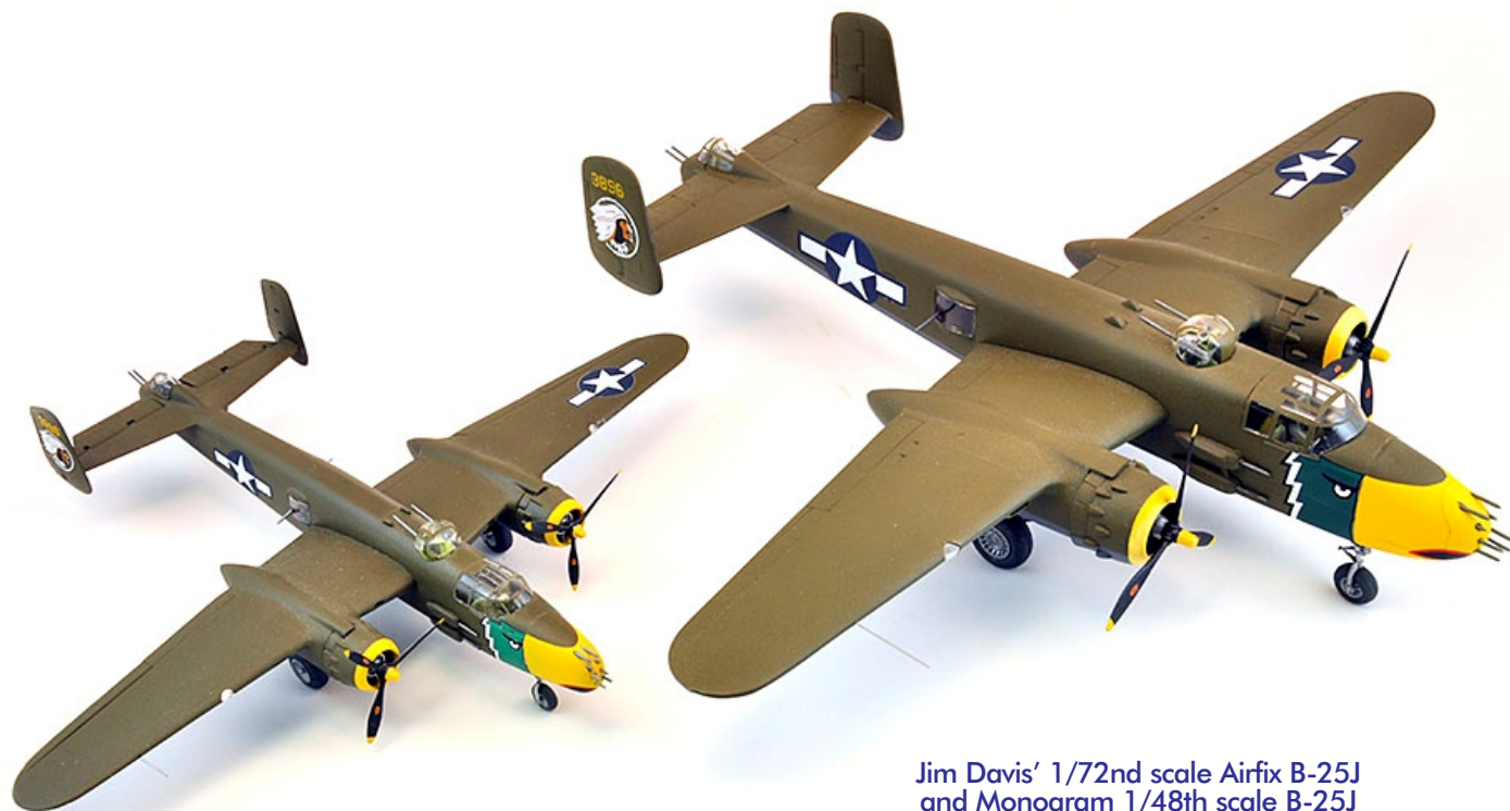
Jim Davis' 1/72nd scale Airfix B-25J and Monogram 1/48th scale B-25J