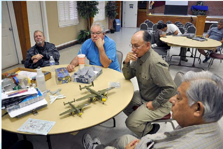
A Show and Tell Table