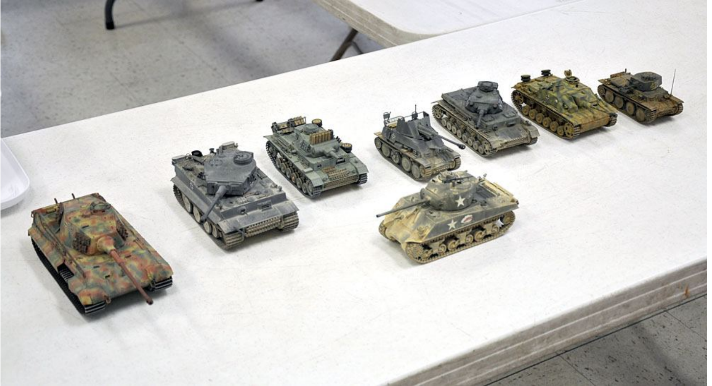
Raul Reyes brought in several of his 1/35th scale tanks to show