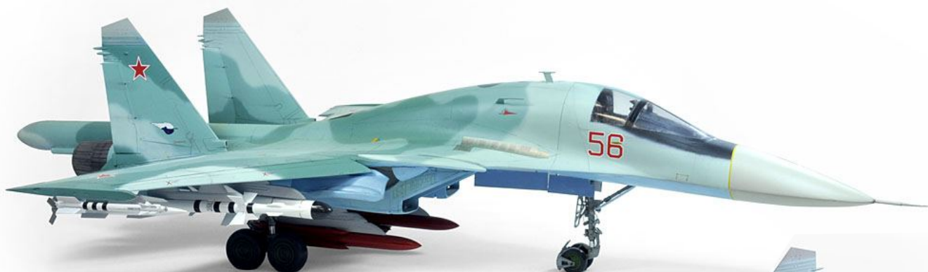
Julio Sanchez's impressive Sukhoi Su-34 in 1/32nd scale