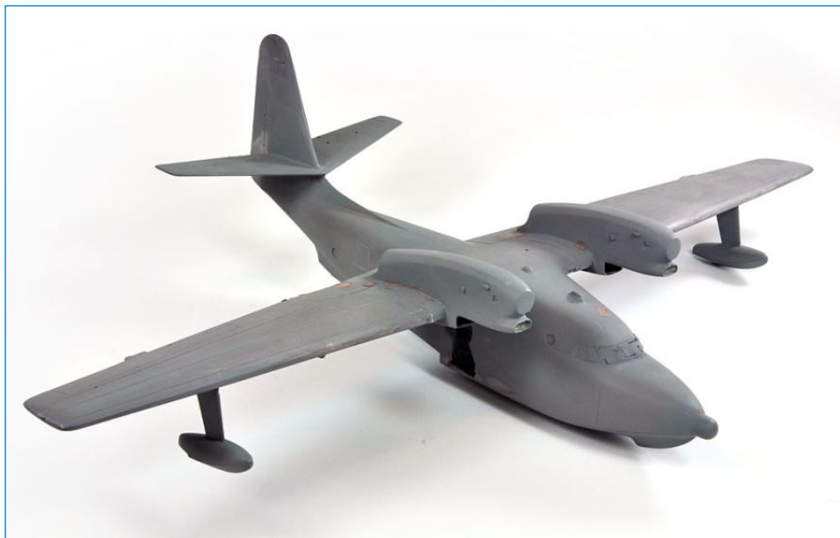
Jerry Wells: Monogram 1/72nd scale Albatross he is converting to a turbo prop aircraft.