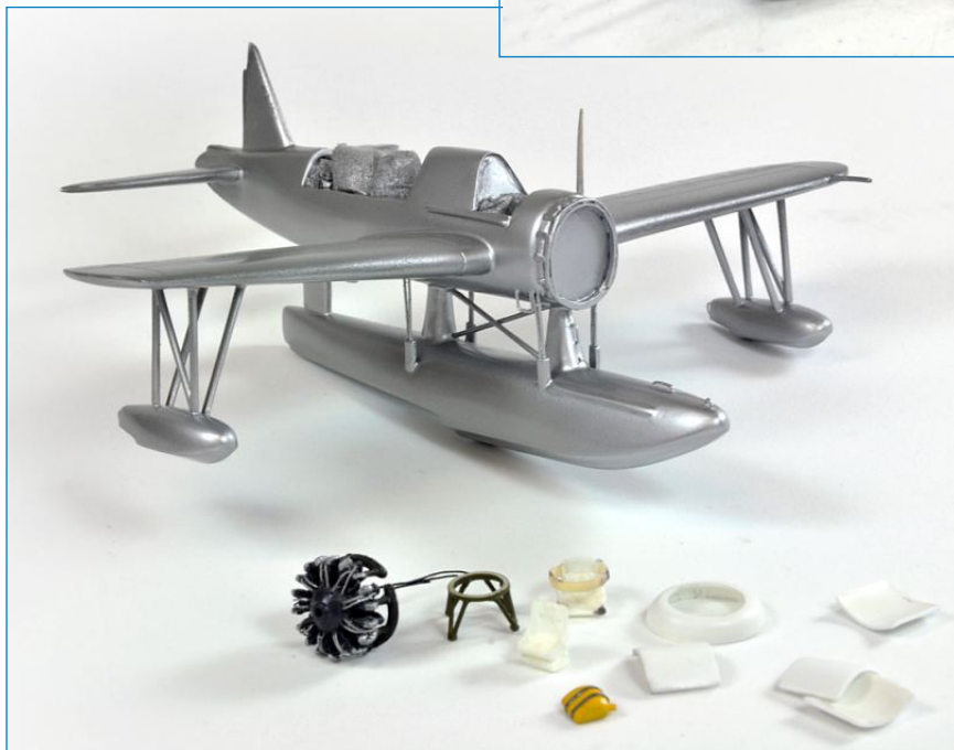
Jerry Wells: Airfix 1/72nd Kingfisher OS2U-1 in VO-4 markings from BB 45 U.S.S. Colorado in 1940.