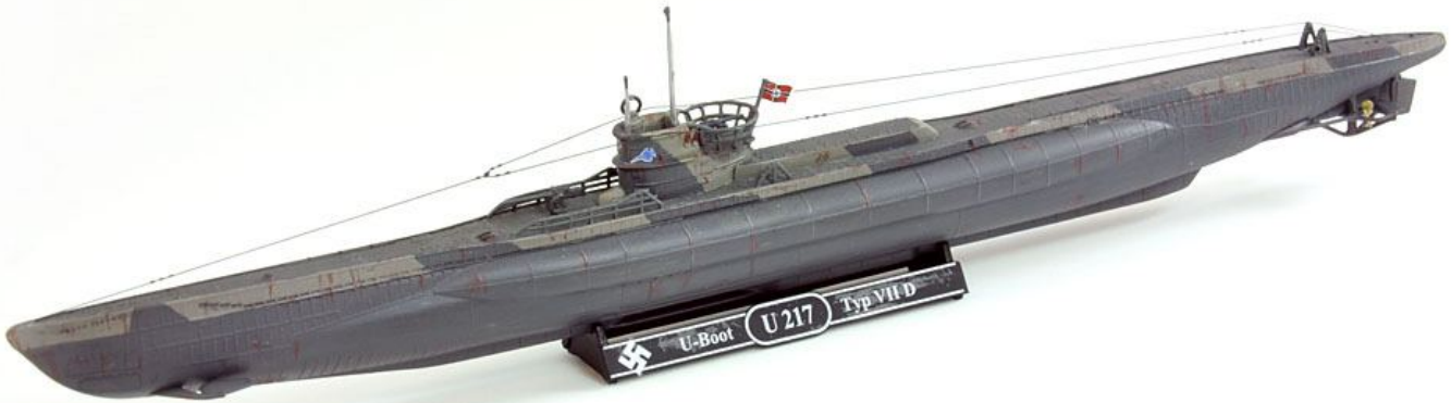
Mike Garcia 1/350th scale Type VIID submarine minelayer.

Boeing F4B-4 Of VF-1 aboard the "Yorktown". He used the Entex release of the kit to build this model.