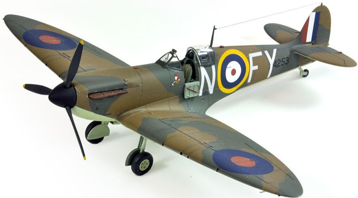
Jack Callaway's Spitfire Mk I in 1/48th scale.

Jack Callaway had very nice Spitfire Mk 1 built from the Tamiya kit in 1/48th scale. Jack has been modeling like there is too much to be finished and not enough time. Jack entered this model in the contest, but as we had only one