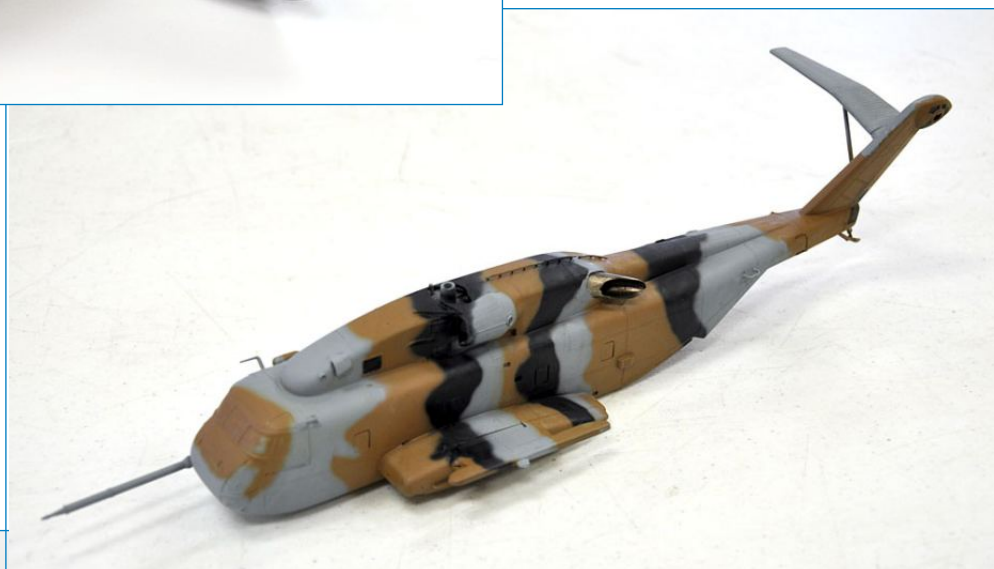
Duane Velasquez: 1/72nd scale Revell scale CH-53 for Special Ops