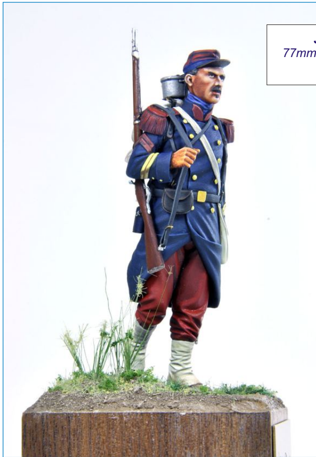
Joe Martinez's 77mm French Infantry man from 1870.