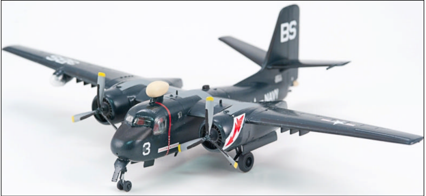
. An S2F Tracker built from the Hasegawa kit finished out Duane's blue series. .