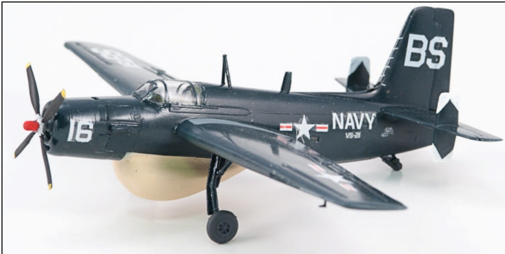
AF-2 Guardian "Killer/ Hunter Team