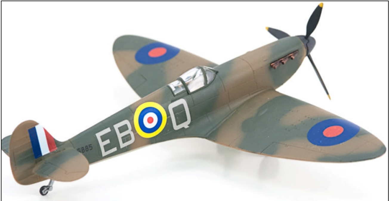
Pegasus Spitfire Mk 1 in 1/48 th scale

Our next meeting is on June 5 at 2:00 PM at 7000 Edgemere Boulevard.