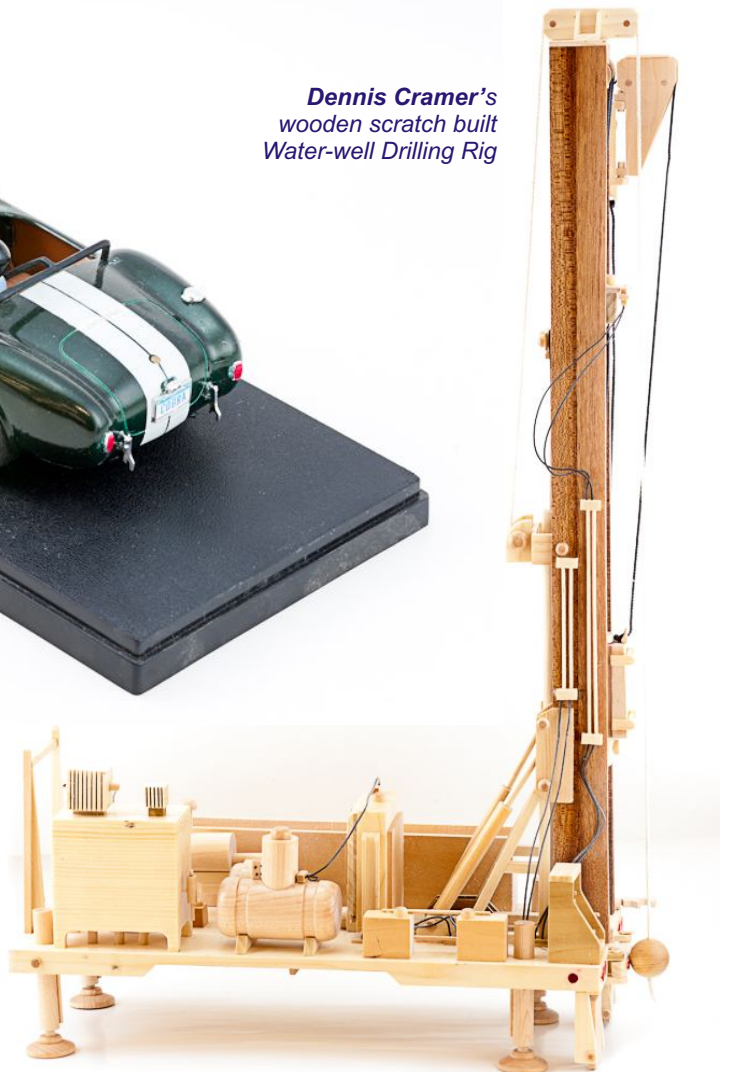
Dennis Cramer's wooden scratch built Water-well Drilling Rig

Dennis Cramer brought a wooden, scratch built Water-well Drilling Rig. Toys and Joys plans were used and the scale is unknown, but about 1/10th. John Estes used to work drilling water wells in New Mexico during the early 60's and worked on a Spudder Rig similar to the model. The rig works by a lift cable system and then dropping the drill bit to punch a hole. Neat stuff.