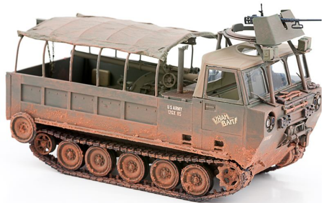
Carl Webster's 1/35th AFV Club M548AI

A reminder, we will hold our first Bassett Place Show on August 26. Make plans to display or to come and see what we have on the tables.