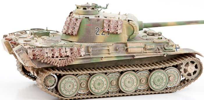
Raul Reyes's Panther G 1/35th scale